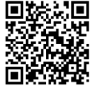
Read this plan on the YouVersion Bible App

The Bible reading plan is a new addition to our Recharge books. This plan is based off a design created by Life Church in Oklahoma City. It is what we call a “harmony of the gospels.” The idea behind it is to read all of the accounts of the life of Jesus in the order in which they occurred, because not all of the gospels were written in chronological order. Reading them this way will give you a different perspective of the goal and purpose of each gospel writer.